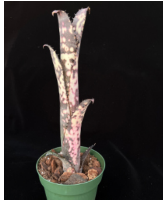
Billbergia 'Tinkerbelle', an example of the tight, tubular conformation of some bromeliads

TUBULAR SHAPED PLANTS — e.g. billbergias, have a few thick leaves. Water does not evaporate as quickly and there is a lens effect. The sun's rays reflect the water onto