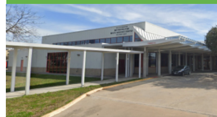
Metropolitan Multi-Service Center 1475 West Gray St., Houston, TX 77019