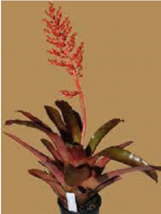
Aechmea fulgens var. discolor , an example of a bromeliad with discolor leaves

DISCOLOR LEAVES — green on top, red underneath, are designed to capture as much light as possible for photosynthesis. Light passes through the leaf and is reflected back by the red pigment so they fully exploit light to their best advantage. They prefer to live in Deep Shade but in too much shade your plant will grow lanky.