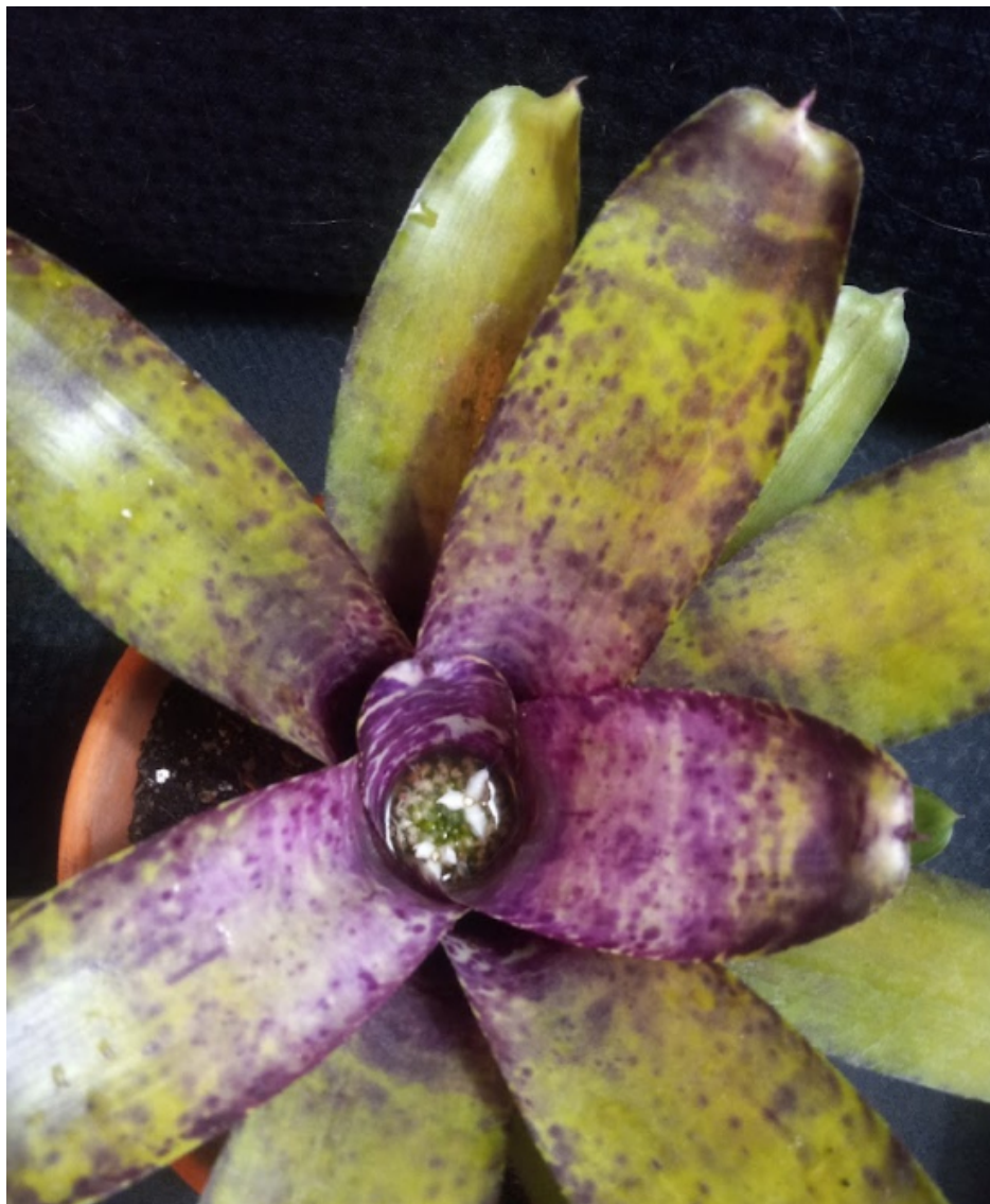
Neoregelia 'Blueberry Pie' from Scherie Townes