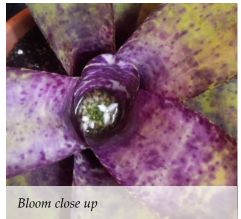
Bloom close up