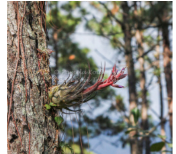
Tillandsia seleriana, picture courtesy of Birdrock Tropicals, an example of an epiphyte growing sideways

the inner leaves. At midday in the fullest heat of day, the plant is upright and the outside is not overexposed to the sun's rays.